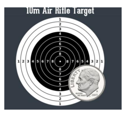
Small; isn't it?

Targets have a total diameter of just 45.5mm or 1.79 inches. The inner ring is a mere .5mm in diameter.