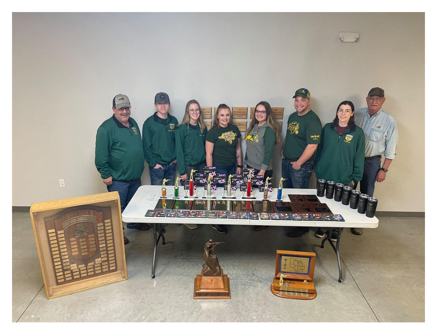
The NDSSA Champion team coaches and advisor. Check their Facebook page for more highlights. Lots of hardware!!